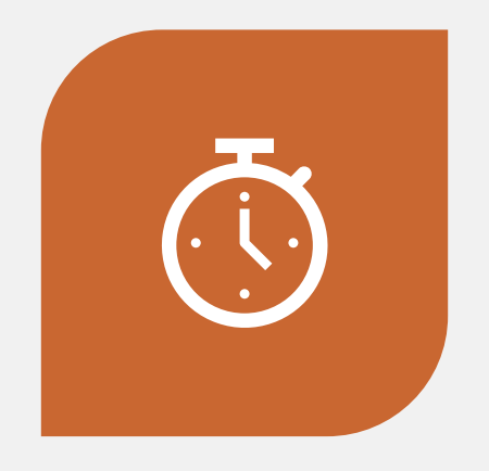
THE MCOS ARE SEEING MANY PACKETS SUBMITTED WITH OUTDATED FACILITY NAMES, NPI AND/OR TAX ID