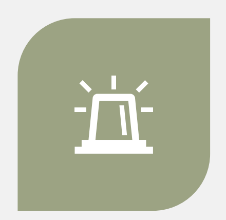
THIS CAUSES MANY ADMINISTRATIVE ISSUES FOR THE MCOS AND COULD RESULT IN A DENIED CLAIM.